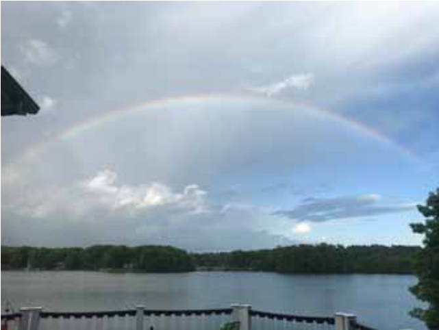
Luke Kloza captured this beautiful rainbow Memorial Day Weekend to start off the summer.

Do you have a desire to play volleyball? Are you 18 or over? We had a women’s volleyball informal pickup game at Beach 1 every Thursday morning from 10 am until noon. Over the last few years our members have dwindled, moved, lost interest, whatever. If anyone is interested in getting this activity going again, just call the Club Office. We can have the net set up for you.