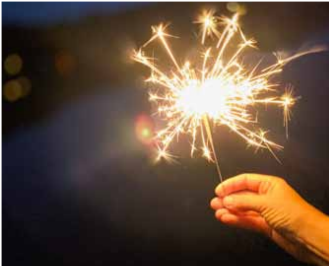
Cody, age 10