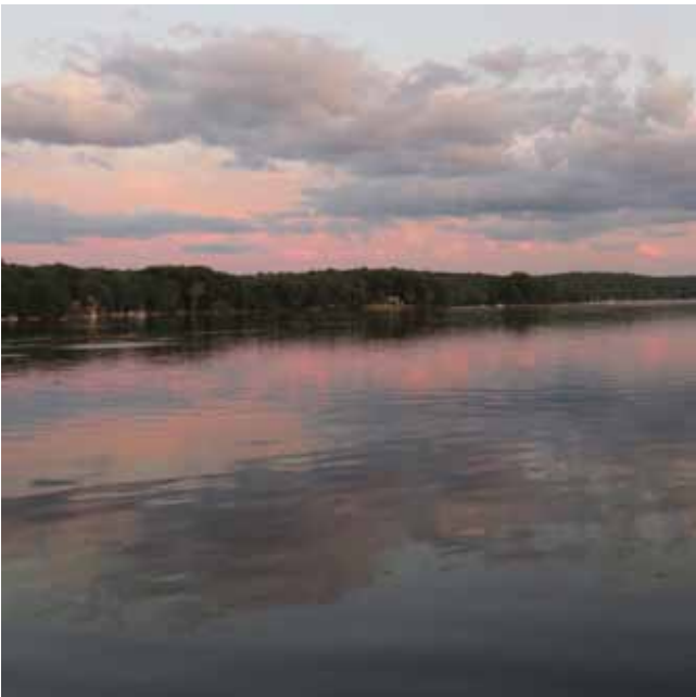
Isabella, 13 years old