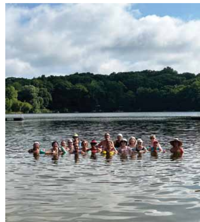
A great group of members at aqua aerobics at Beach 1

https://bestreviews.com/lawn-garden/gardening/best-soil-test-kits