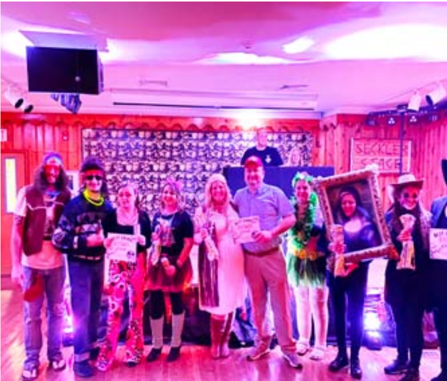
Halloween party, Halloween Trunks