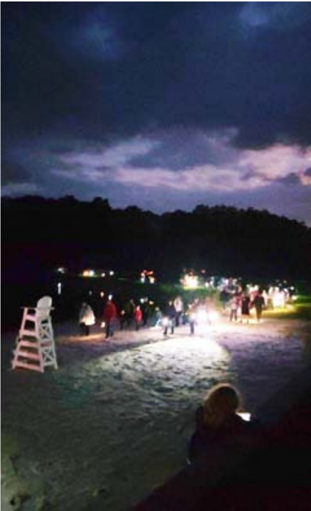
Lantern Walk