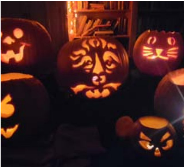
Great night creating ghoulish pumpkins.