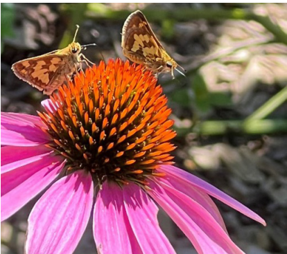
Two Peck's Skippers nectaring on coneflower

Reducing the amount of grass lawn, replacing it with native plantings, adapted to the highlands ecosystem will bring benefits. Native plants require less water, fertilizers and pesticides; thus there are less nutrients and other chemicals washing into the lakes. You have less mowing and weed-whacking. Native plants attract beneficial pollinators, many that are beautiful, such as monarch butterflies, but also smaller butterflies, moths, bees, wasps and flies. These pollinators