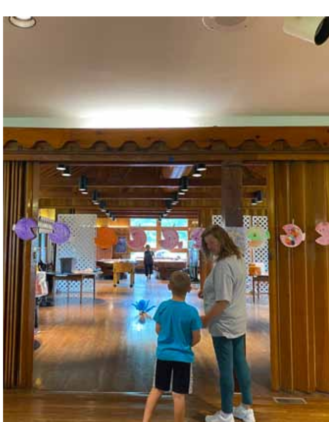
Kids activities are in full swing at the Clubhouse and up at Beach 1 during Christmas in July and Under the Sea weeks.