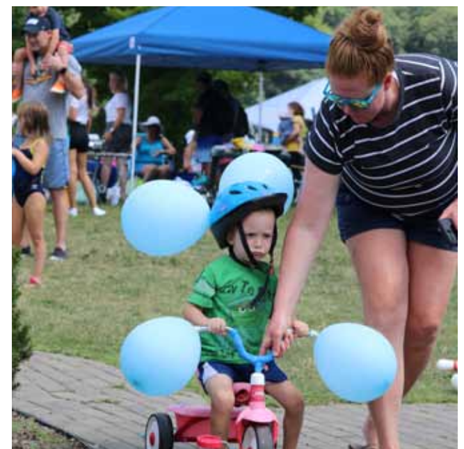
More Family Day photos of the Baby Parade, Bike Parade and Talent Show