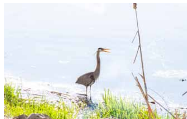
Our local Blue Heron

If you enjoy writing, graphic and web design, photography, editing, or other communication related pursuits, consider joining our committee. Send me an email at communications@hlcc.org . Our committee meets every other month for about an hour. Most of the work we do is independent, but we learn from one another as we go. Also, we are building a library of photos. If you have a photo that you've taken of our beautiful lakes and surrounding areas, share it with us so that we can share it with others. Use the same email address. Let us hear from you.