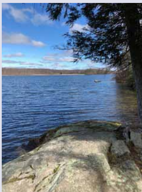
Overlooking Wawayanda Lake from South End Trail

SUE ROSS, CHAIRPERSON, COMMUNICATIONS COMMITTEE