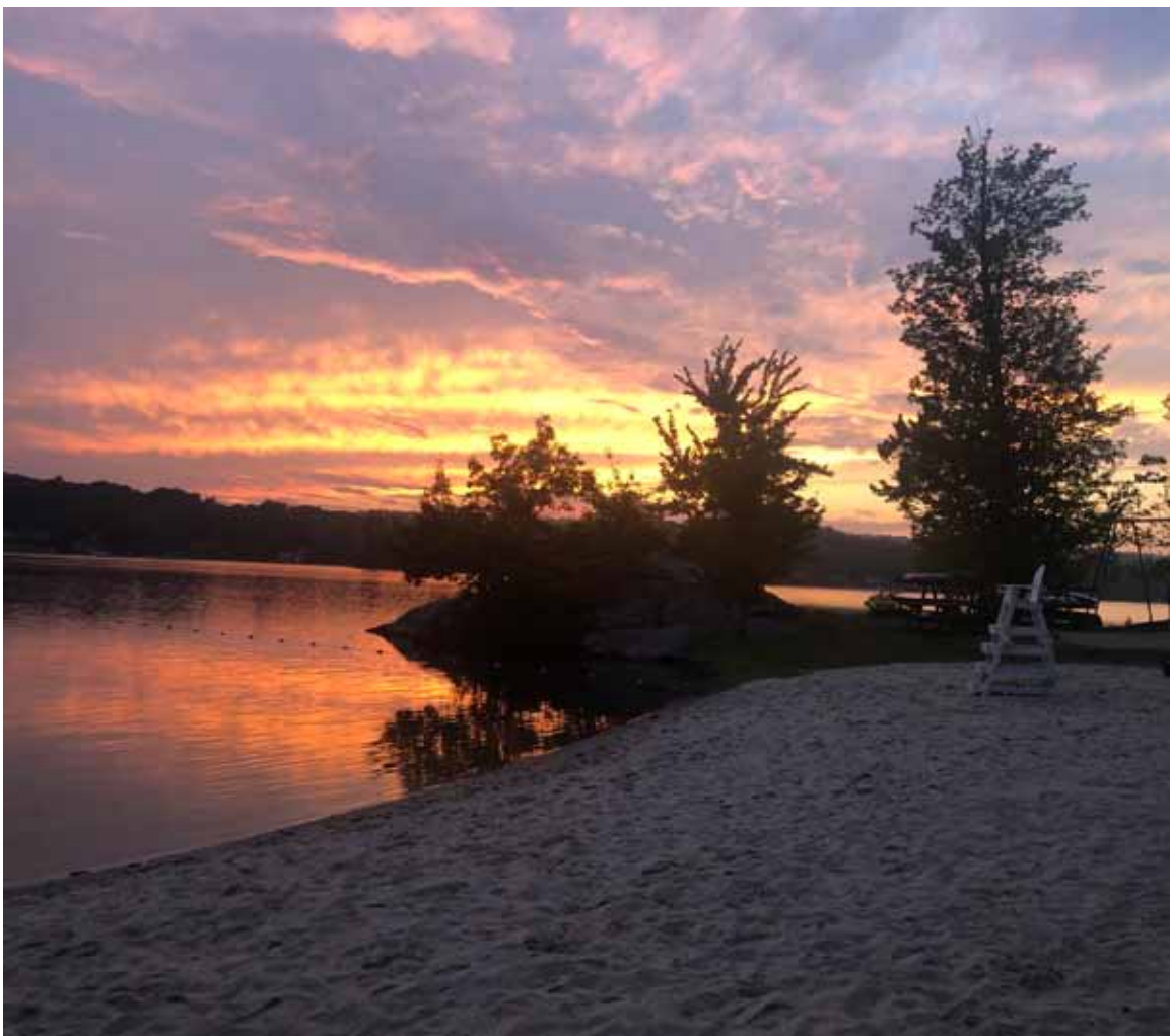
Another view of the sunset captured from Beach 4 by Rosemary Polhemus on July 8