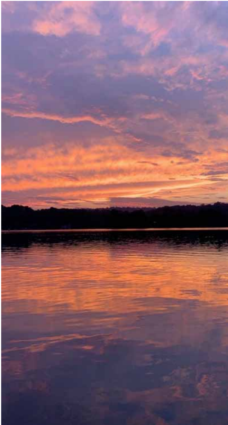
Sunset from Beach 4 on July 8