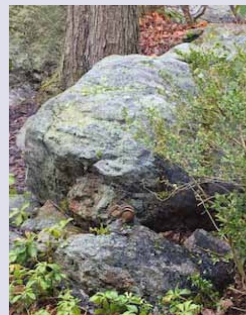
Woodland critter spotted along the way

Despite years of living so close to the Park, it wasn't until recently that I started actively exploring it. Now I go there whenever I can and never tire of it. Most trails are easy to moderate in difficulty. Even if you are a beginner, as long as you have good footwear and are in reasonably good health, you can comfortably navigate them. While I have on occasion seen a bear or two, they always continue on their way without giving me a second glance. (I never carry food with me while hiking for fear that it might peak their interest.) Far more frequently, what I see is a wide array of birds, squirrels and chipmunks. Regardless of the season, I find what nature always offers...ever changing, breathtaking beauty and serenity. To learn more about the park and find a trail map that you can download and take with you, visit https://www.state.nj.us/dep/parksandforests/parks/wawayanda.html .