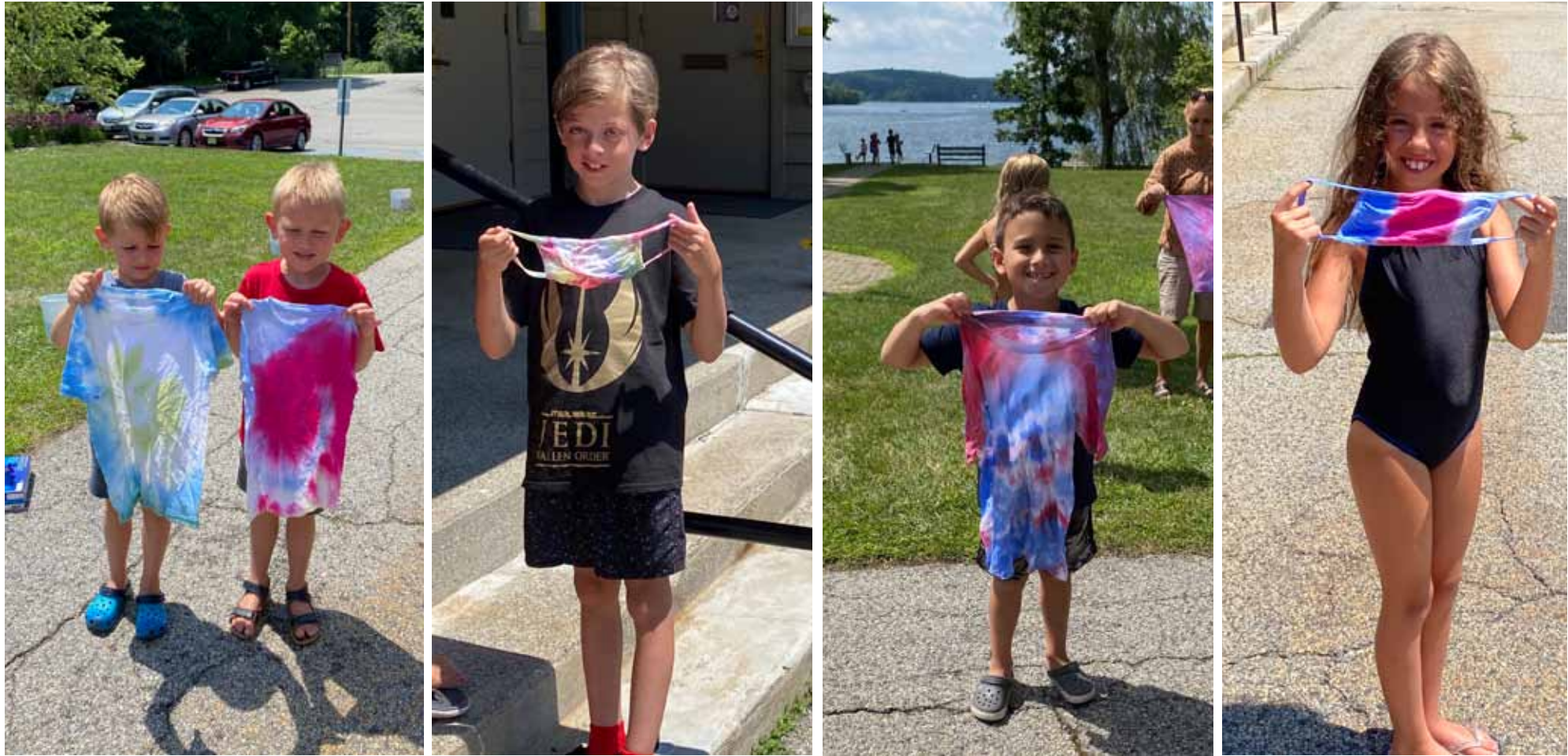
Tie Dye Day