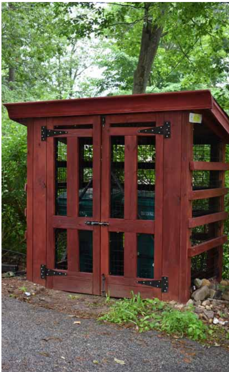
One of many ideas for securing garbage

Over the last few weeks I have spoken to many residents about their garbage proofing techniques which range from the simple to the complex, and heard about their successes and failures along with improvements they hope to make in the future. While there will always be mixed results with so many pro-active approaches to try out, they all agreed on one common thing - being diligent and keeping your trash secure is still one of the best deterrent they have found.