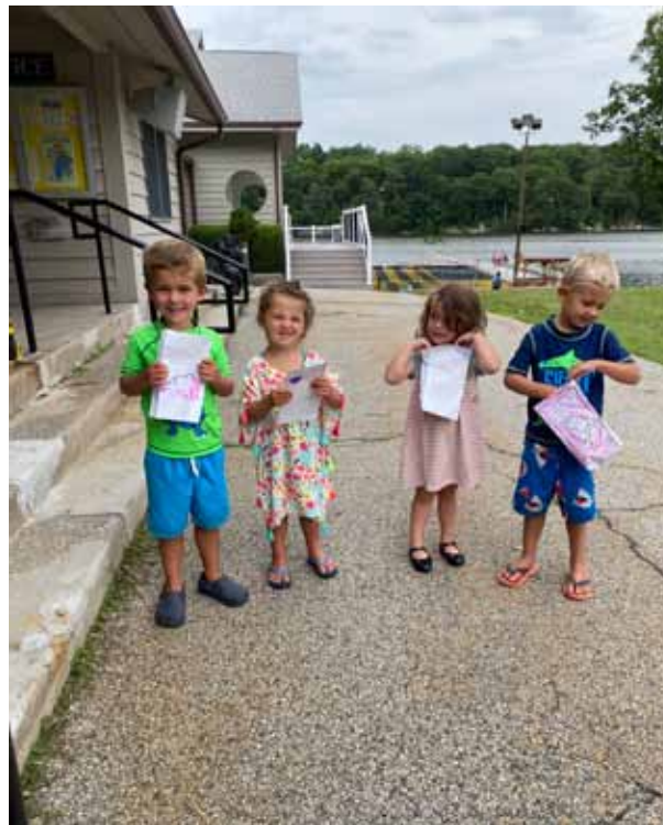
Kids showing their crafts during Jurassic Week