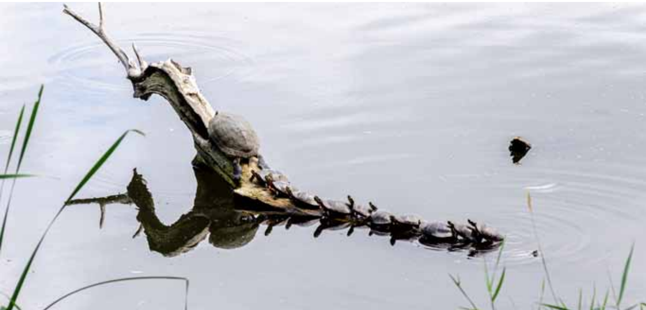
Two rare sites, ten turtles sunning and a green heron eating lunch.