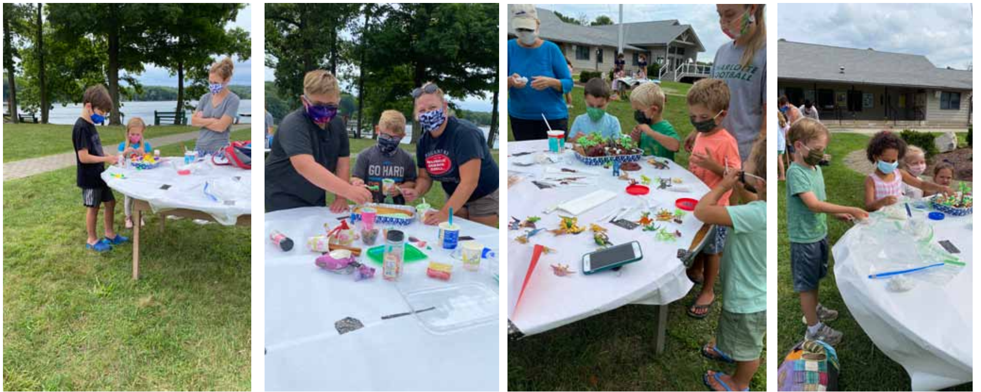
During Jurassic Week, our Cake Contest had about 16 creatively decorated cakes.