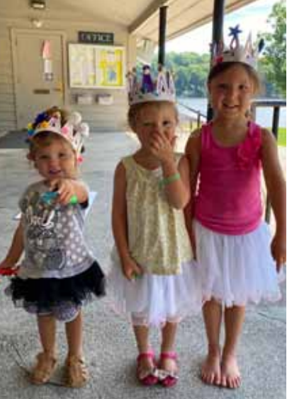
Prince and Princess Week brought out the royalty. Kids had fun making crowns, bracelets, castles and bejeweling just about everything. The week was capped off with a parade complete with full costumes!