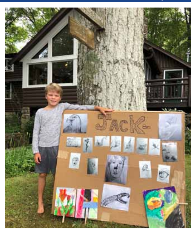
A proud 8-year old with art on display

Like us on Facebook highlandlakesnj and follow us on Instagram @hlccnj