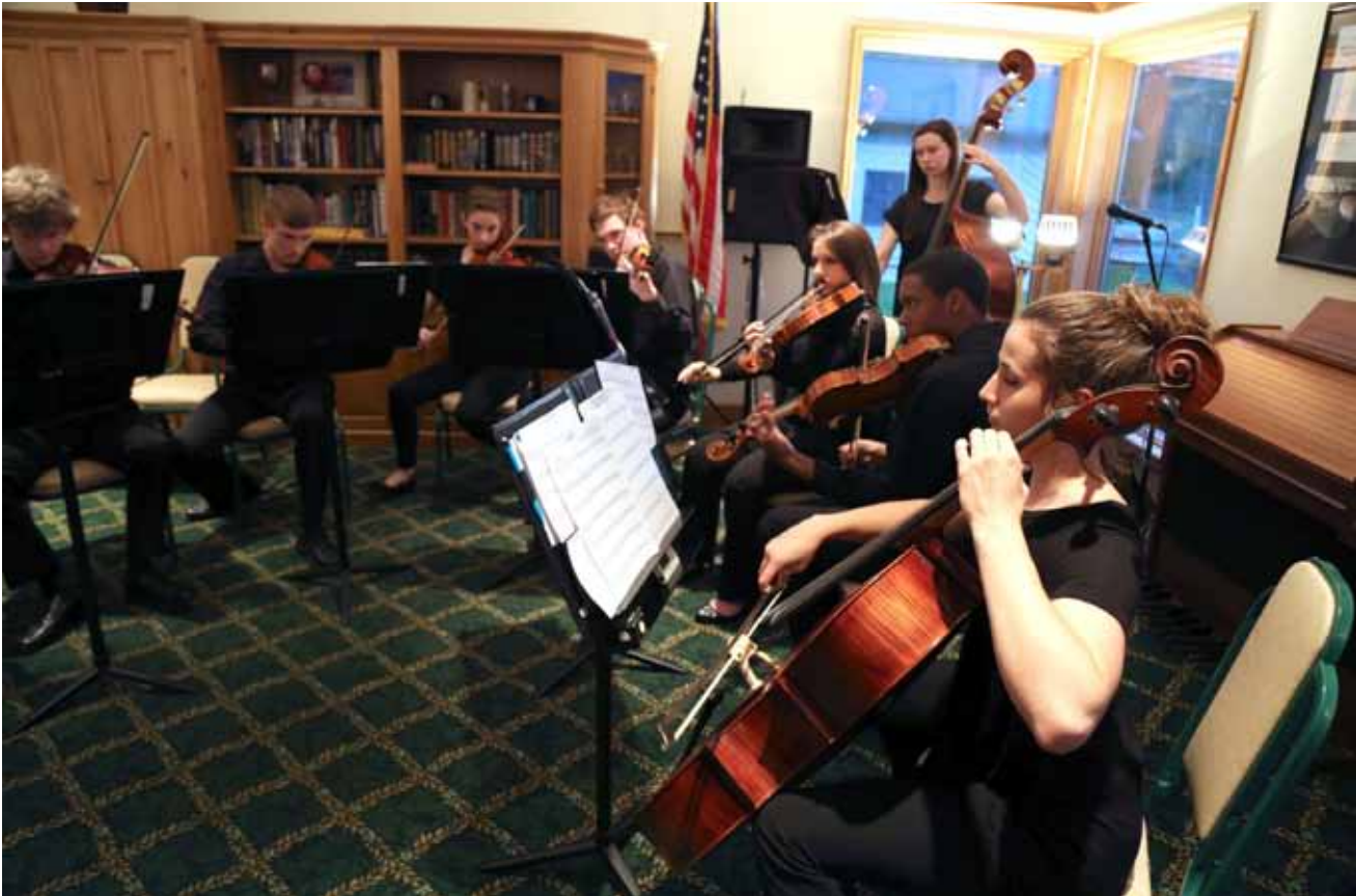
VTHS Chamber Orchestra