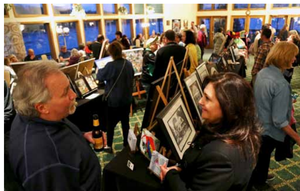
Enthusiastic crowd gathers for the evening