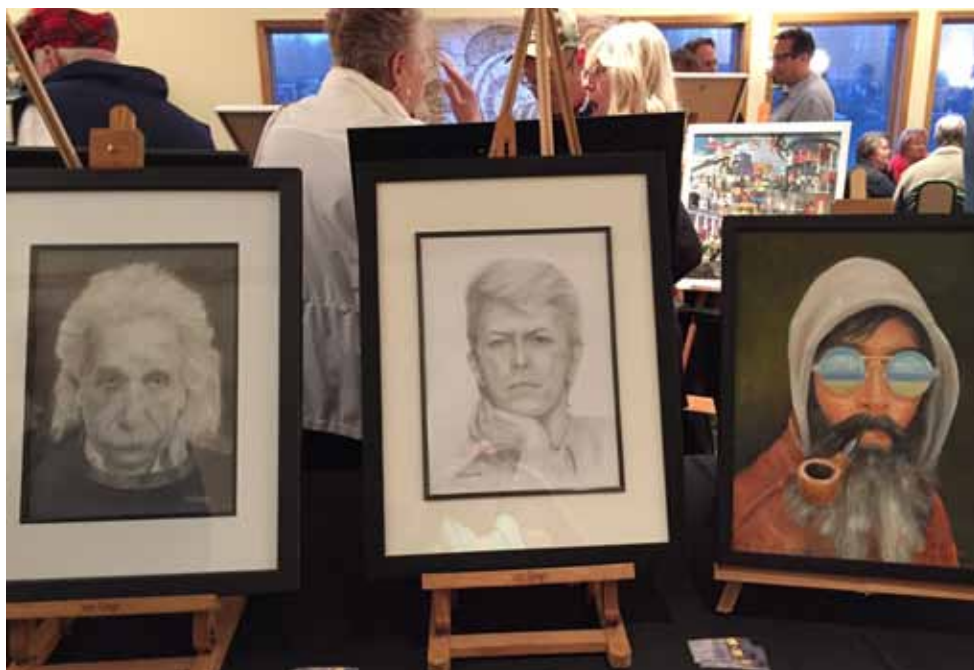
Art by Bruce Young