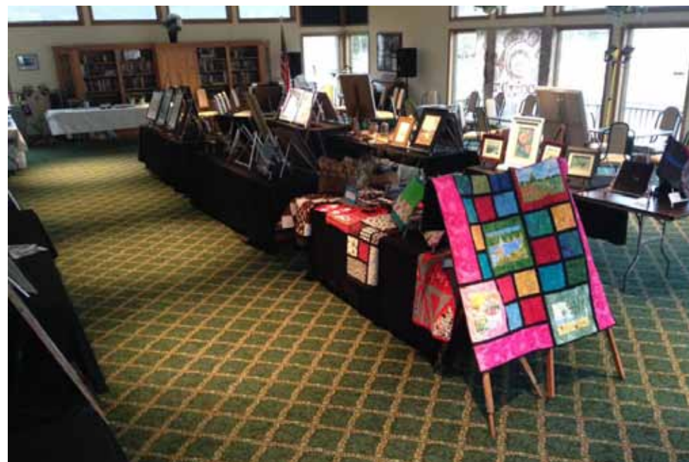
The Lakeroom awaiting guests