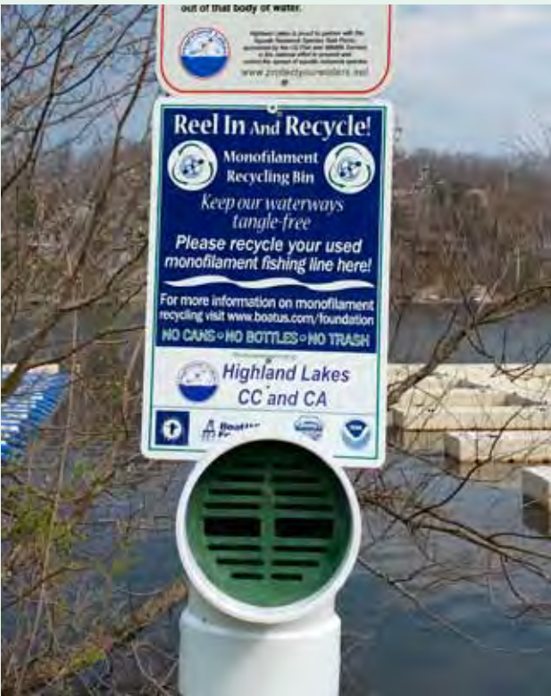
Fishing line disposal receptacle.