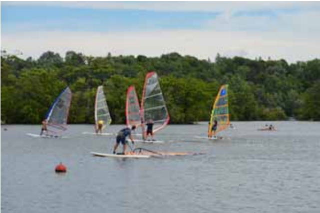
July 2 windsurfing fleet race.