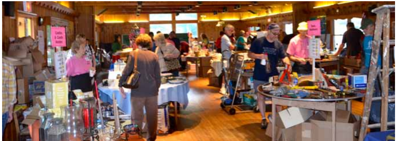
Pool room on sale day

We never know what will be coming through the door that Friday, but one thing is certain: We receive a lot of donations! These items always fill the Seckler Room of the