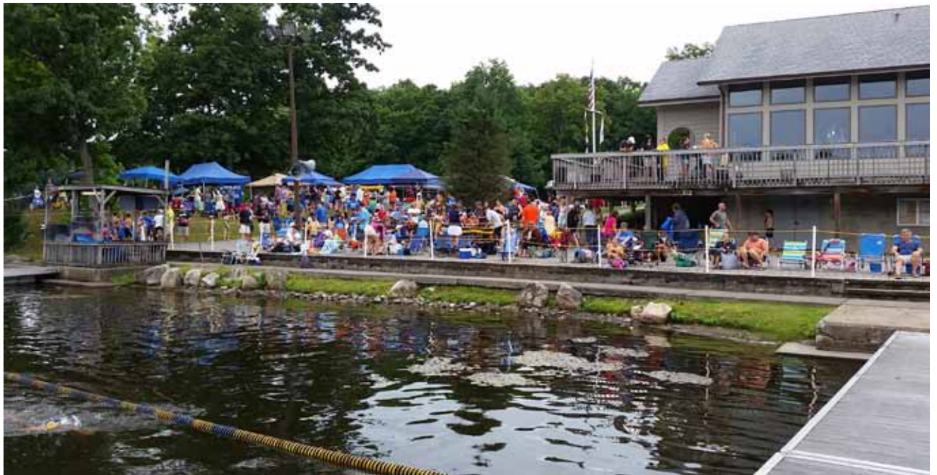
Continued on Page 6 Crowds gather in anticipation of seeing their swimmers.

On July 30, 2016, 393 swimmers ascended the mountain up to Highland Lakes, representing 10 different swim teams. The morning sky was threatening, but the grounds had largely been set up the day before. Todd Wootton, Dom Beninati and Rich Spoerl, along with our stellar maintenance men, put up the tents and fencing, and various other hands gave an assist so that everything was ready for the next day, come rain or shine.