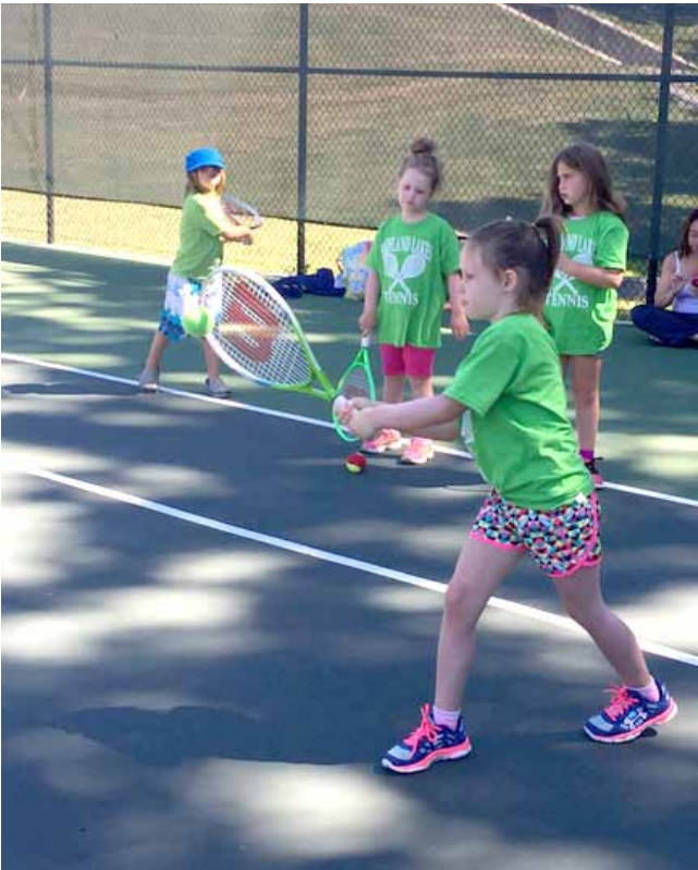
Wednesday morning tennis lessons