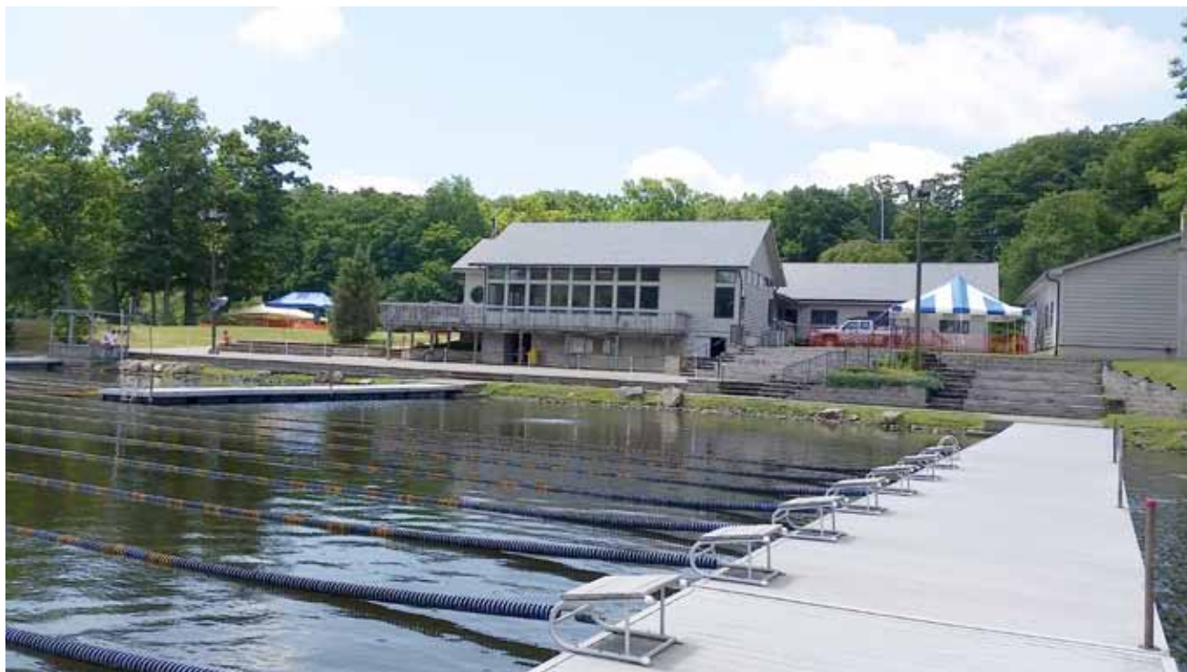
The HL Clubhouse is set and ready for action.