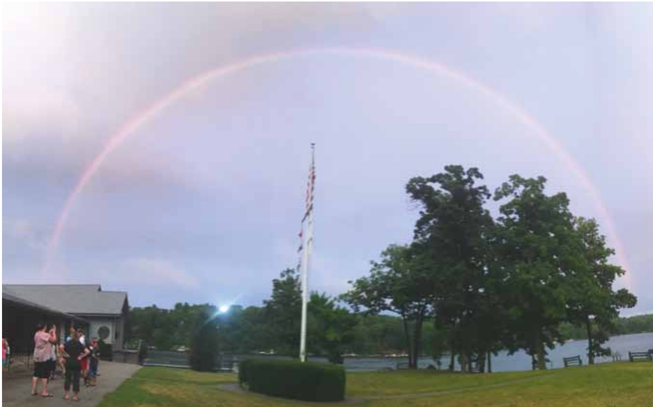
Eleven-year old Lia Wootton captured this beautiful rainbow on July 25 after a summer rain shower.

Volume 2016 | Issue Number 13 | August 13, 2016