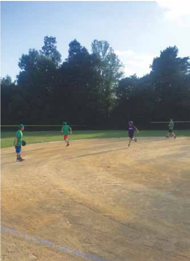
The Hornets battle the Wasps at Field 1 on Thursday night.