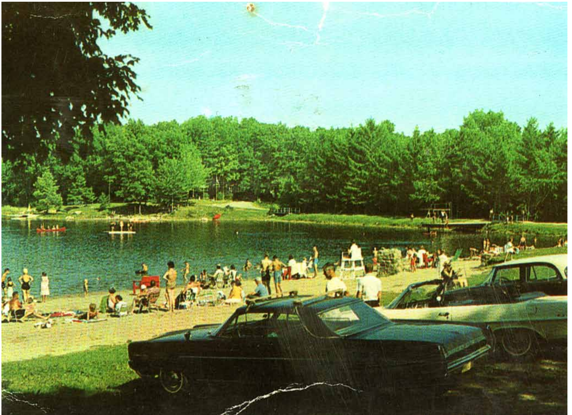
Special parking permits for Beach 1 lawn area SOLD OUT!

MIKULIK LAWN AND LANDSCAPE LAWN CARE, WEED CONTROL, FERTILIZING, TICK CONTROL, CLEAN UPS, SHRUB TRIMMING, LANDSCAPE PLANTINGS, MULCHING, PATIOS, AND MUCH MORE!