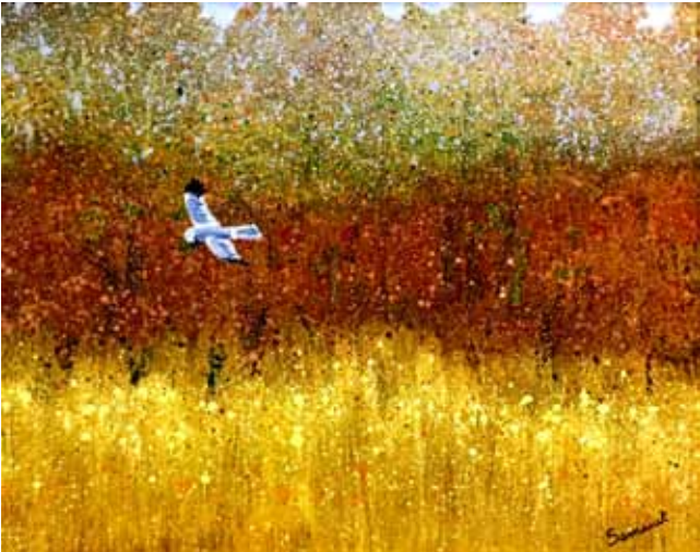
Lois Semanek - Golden Marsh (acrylic)