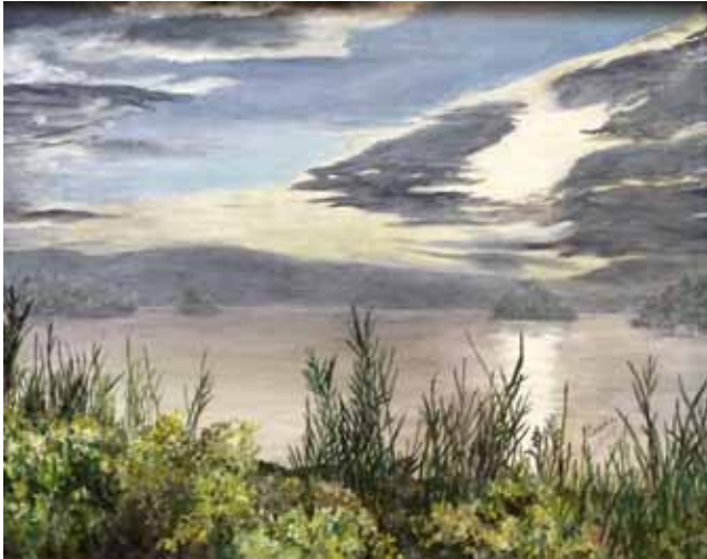
Carole Fortenbach - Sunburst (oil)