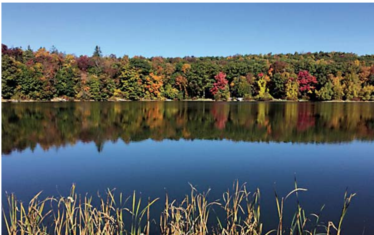
Lake 1 welcomes fall