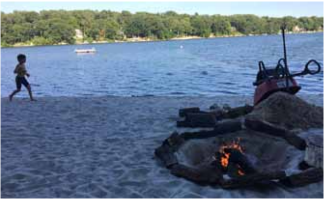
Bonfire on the Beach from 2018.