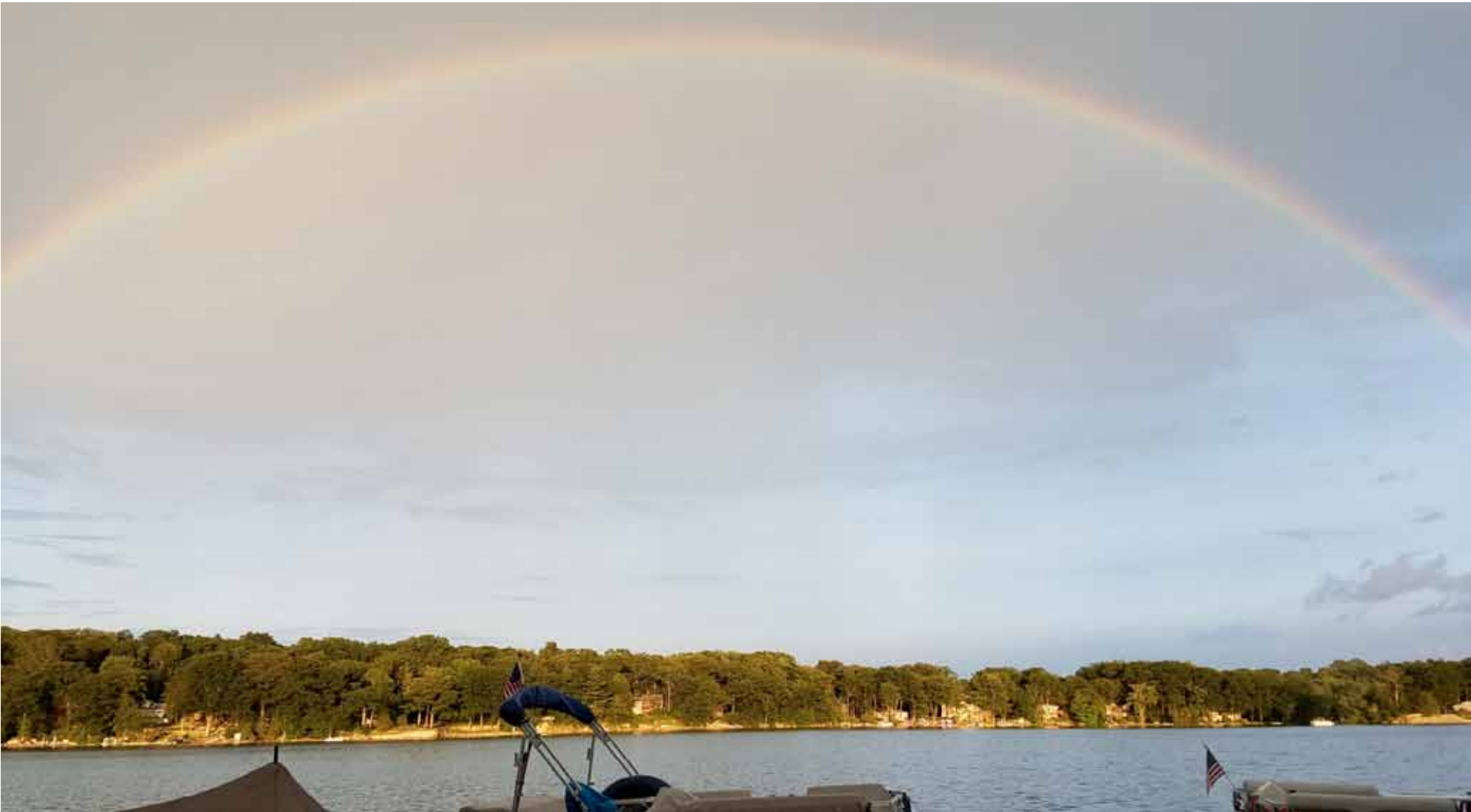
A beautiful rainbow was spotted on July 20 over the main lake.