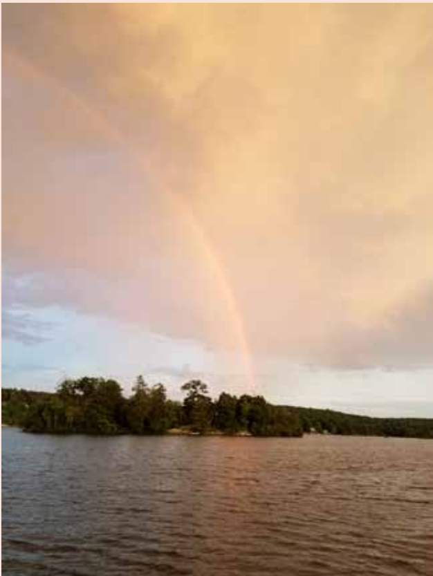
Slight double rainbow