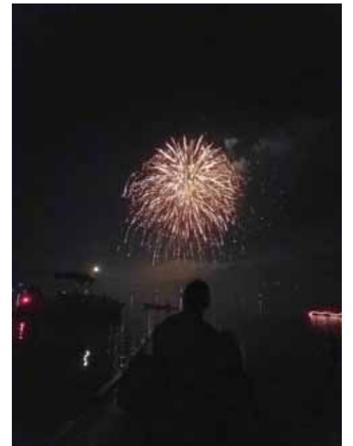
Family Day Fireworks.