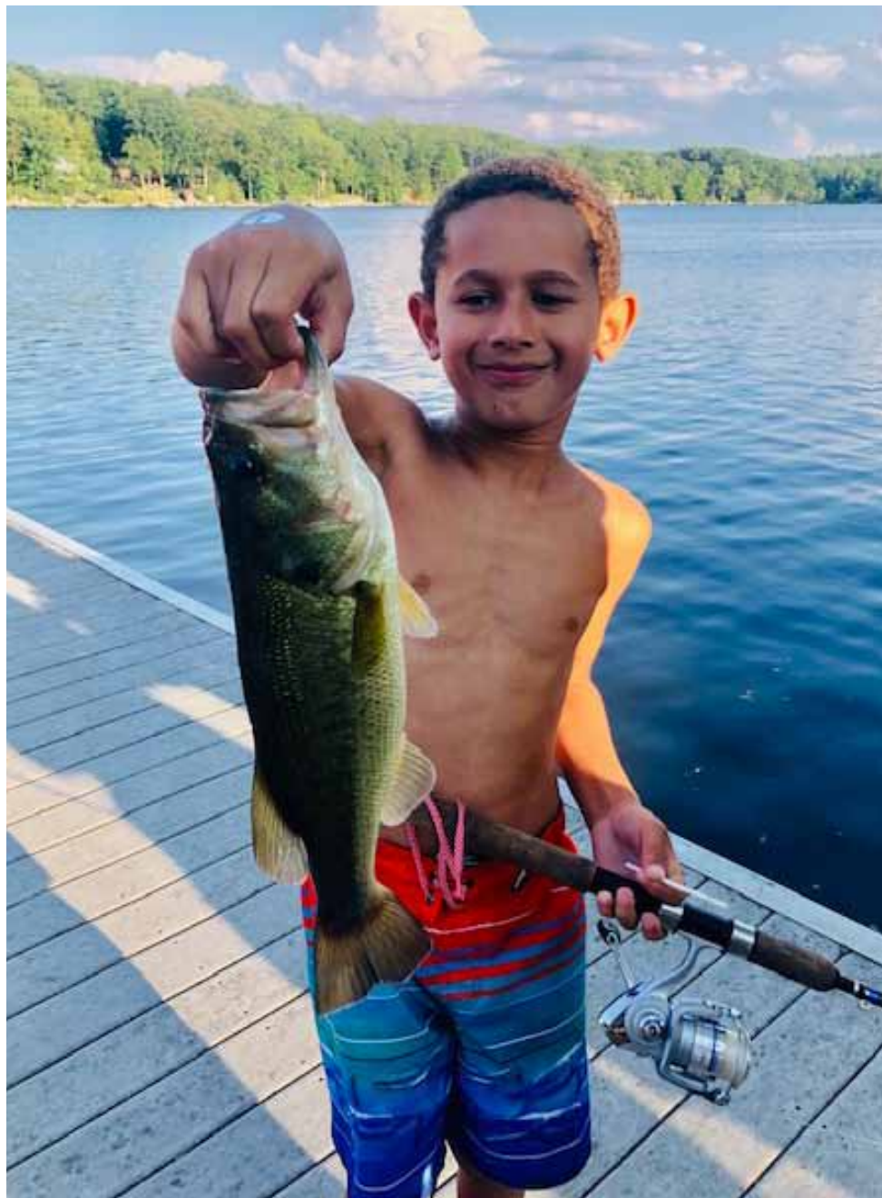
Family Day Fishing Derby.