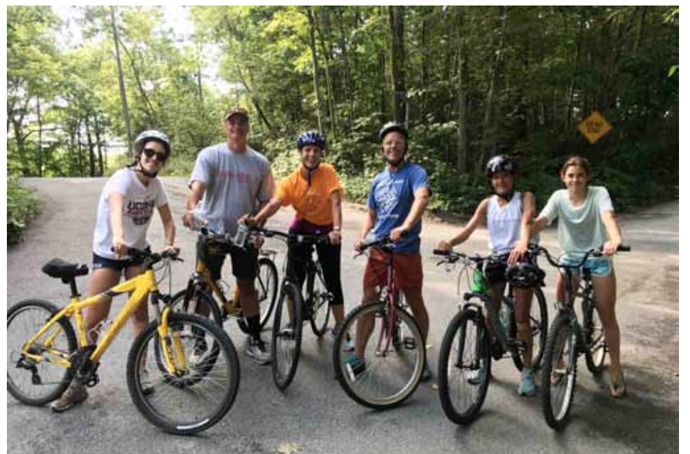
Family Day Quadrathlon participants.