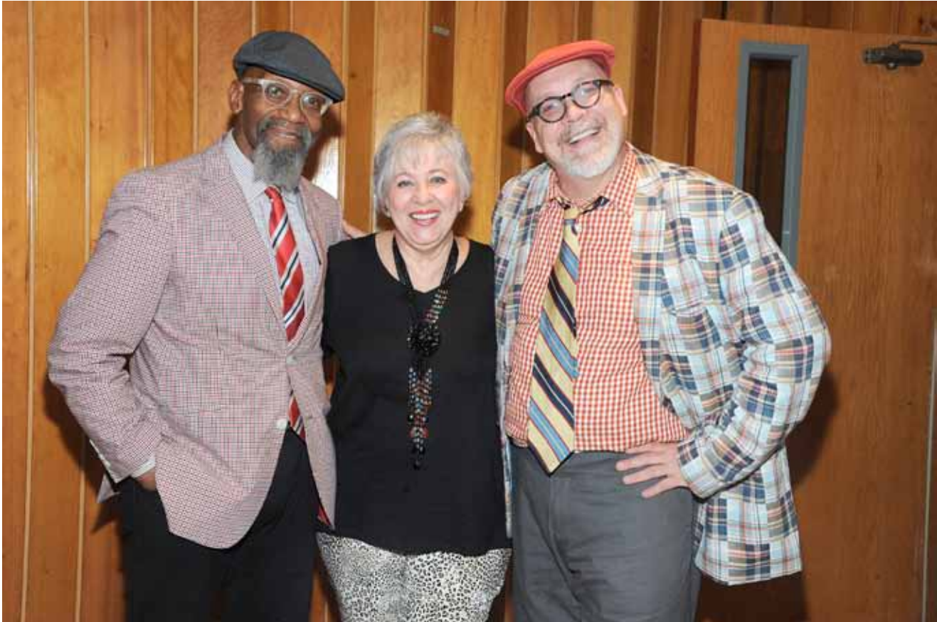
HLCC models and proprietors of Style Counsel and Blue in Warwick attend a “Midsummer’s Night Fashion Show” on August 6, 2019, at Highland Lakes, New Jersey.