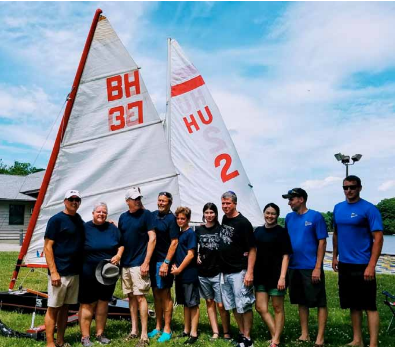
June 29 Boat Show Fleet Captains.