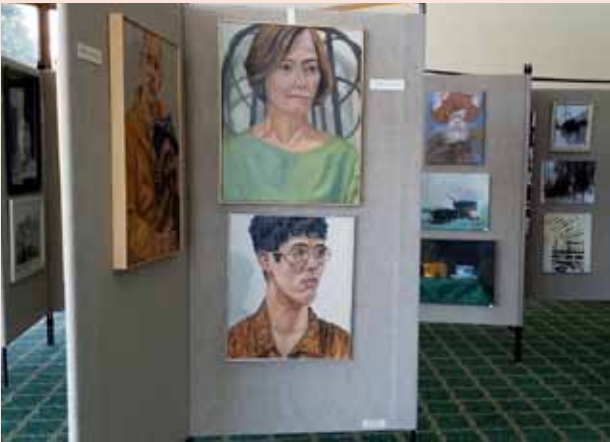
A glimpse of the art work displayed in the Lake Room.