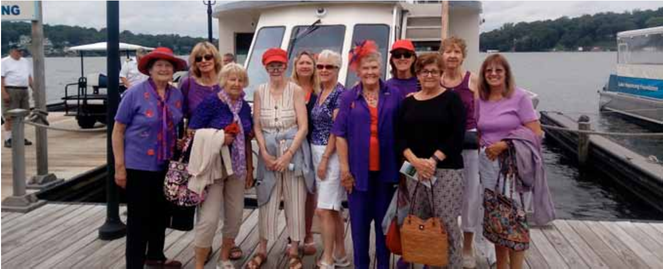
The Red Hatters at Miss Lottie, boat ride on Lake Hopatcong on August 24.