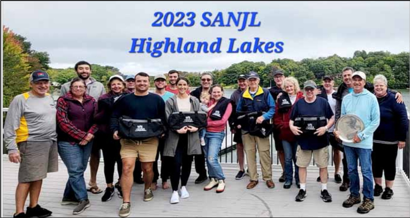
Highland Lakes hosted the final regatta of the SANJL Championship Sunfish Series on September 30, 2023. 17 sailors representing 6 lakes; Packanack, Spruce Run/Hunterdon, Green Pond, Mountain Lakes, Pines Lake and Highland Lakes duelled for final placings. Congratulations to all. It was a great day!