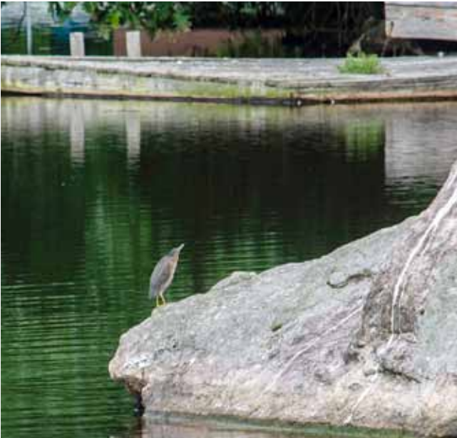
We have a lot of blue herons, but I captured this photo of the less outgoing green heron hanging on one of the rocks in Lake 3. I haven’t seen one on any of the lakes before this summer.