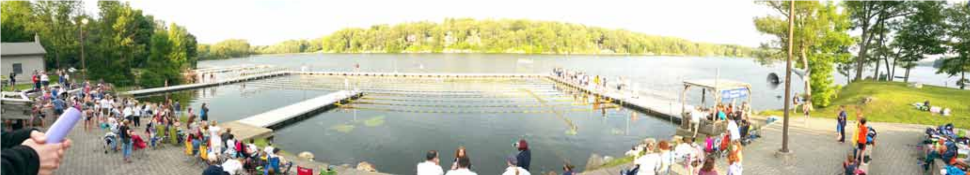
Panoramic view by Sue Buruchian.