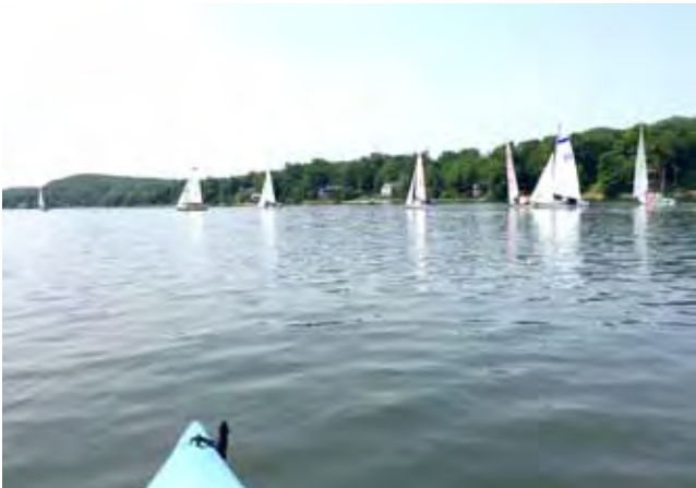
The view from Jeff Stoveken's kayak