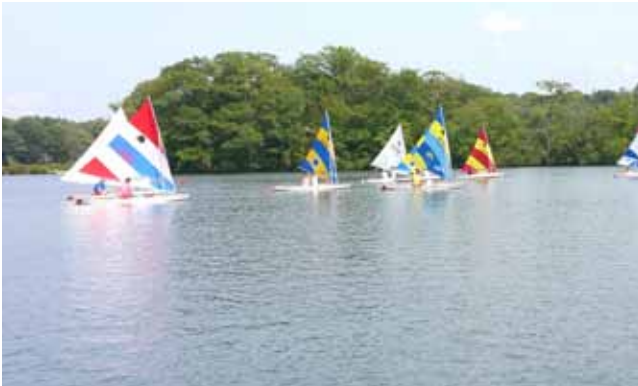
Sr. Sunfish Regatta Day 1