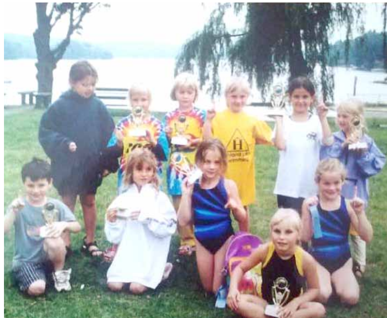
Previous "B" winners from 2001.