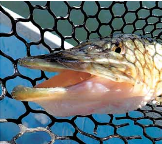
Chain Pickerel

The most recent meeting of the HLCC Fishing Committee was held on April 13 at 8 pm, and you could feel the excitement in the room, as members discussed the upcoming fishing events for the 2017 year such as the kids fishing derby, informational events and the possibility of holding some free casting lessons for anyone interested in learning more about fly fishing. Annual stocking of the main lake will be postponed this year due to the lowering of the lake in early fall, but we will continue the planned stocking at the other 4 lakes in our area. The next meeting will be held May 11, 2017, at 8 pm at the clubhouse, please join us.