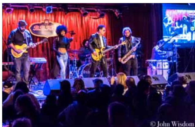
Project Grand Slam