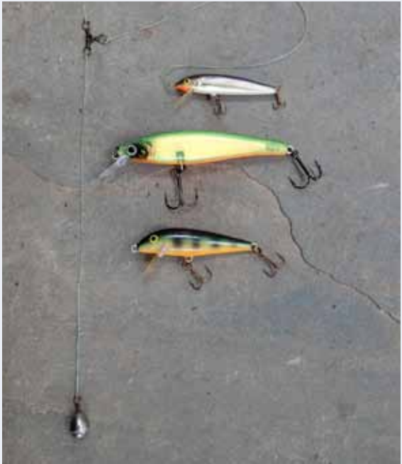
A variety of lures to use for Walleye with this technique.

Walleye fishing has been very productive this last week. During the day on deep fished swimbaits and late into evening on top water lures, using shallow crankbaits near shorelines. One way to attract walleyes that are closer to the bottom, feeding on suspending baitfish during the day, is by way of a 3-way swivel and a drop weight. This is a smaller version of using downriggers, which isn't possible in kayak or row boat. Setup: Tie the 3 way swivel onto your line, then off the bottom eye connect a drop weight. From the side eye, tie on a small suspending crankbait, on a foot and a half of line. This setup can either be trolled behind the boat, or dropped out and fished back slowly, pausing in between. I prefer to use a light braided line for this setup, which makes unwinding easier, as a few tangles are inevitable.