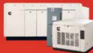
Cummins Connect Series home standby generators

Lightning was powering through the clouds outside. Thanks to your planning, their story time, and life as you know it, continued inside.