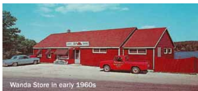
Wanda Store in early 1960s

If you'd like to join our committee, or have questions contact bejaggi@warwick.net or 973-764-1152.