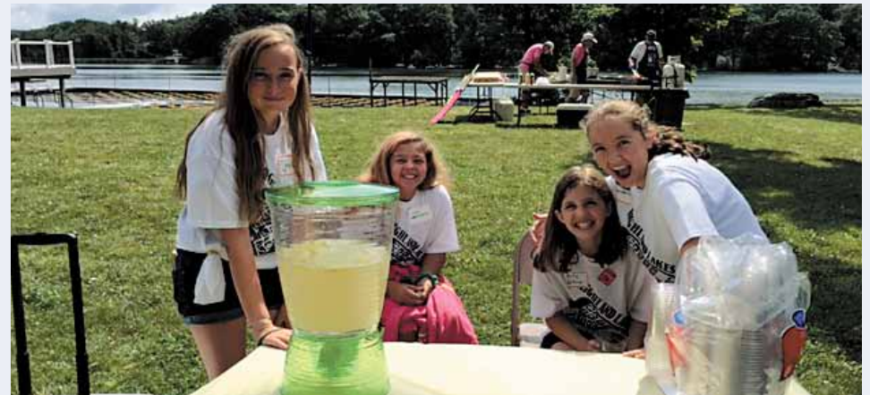
Members of Teen Council contributed to the GWF Sale selling lemonade.