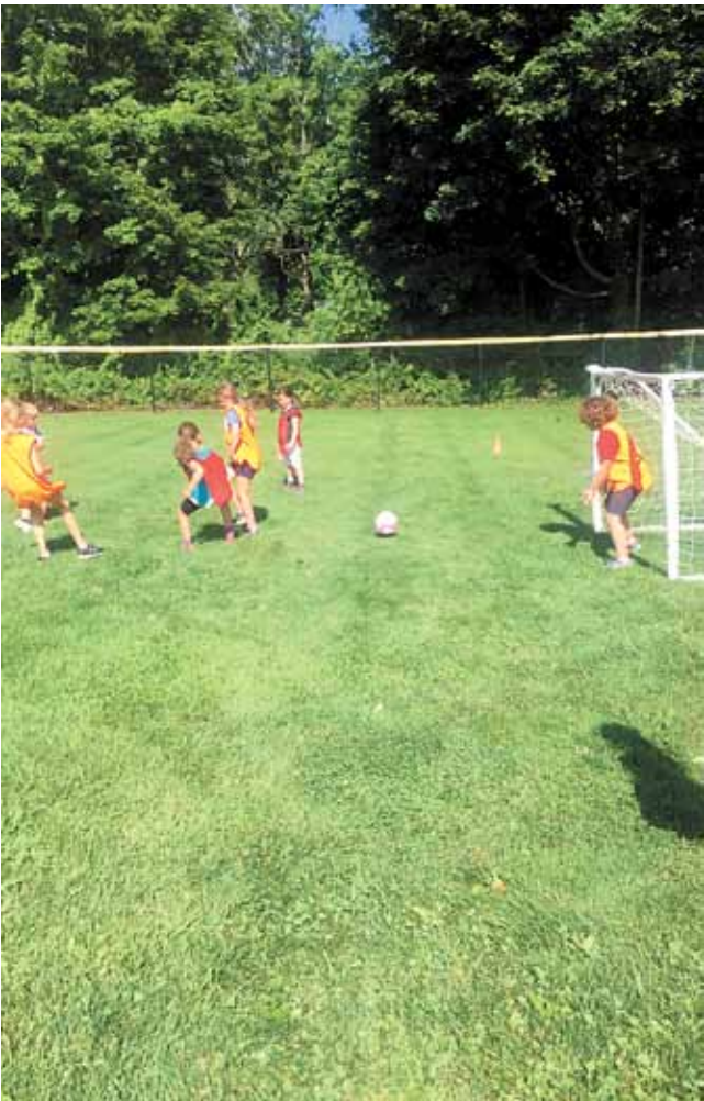
Friday morning soccer at Field 1