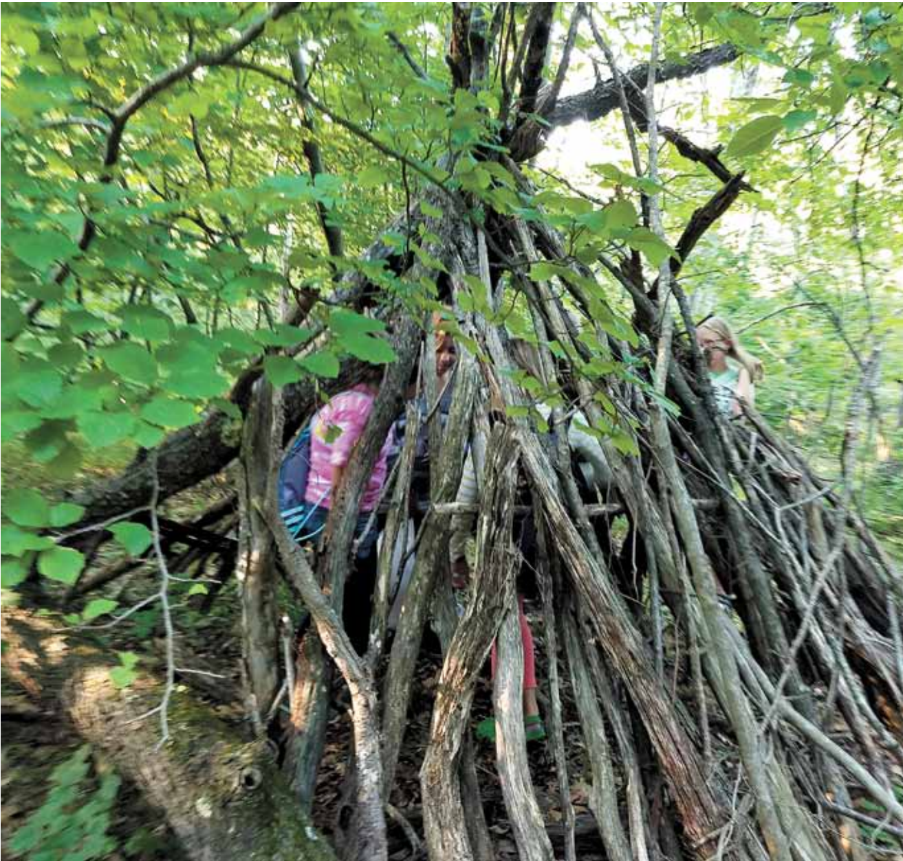
A surprise find of a stick tee-pee