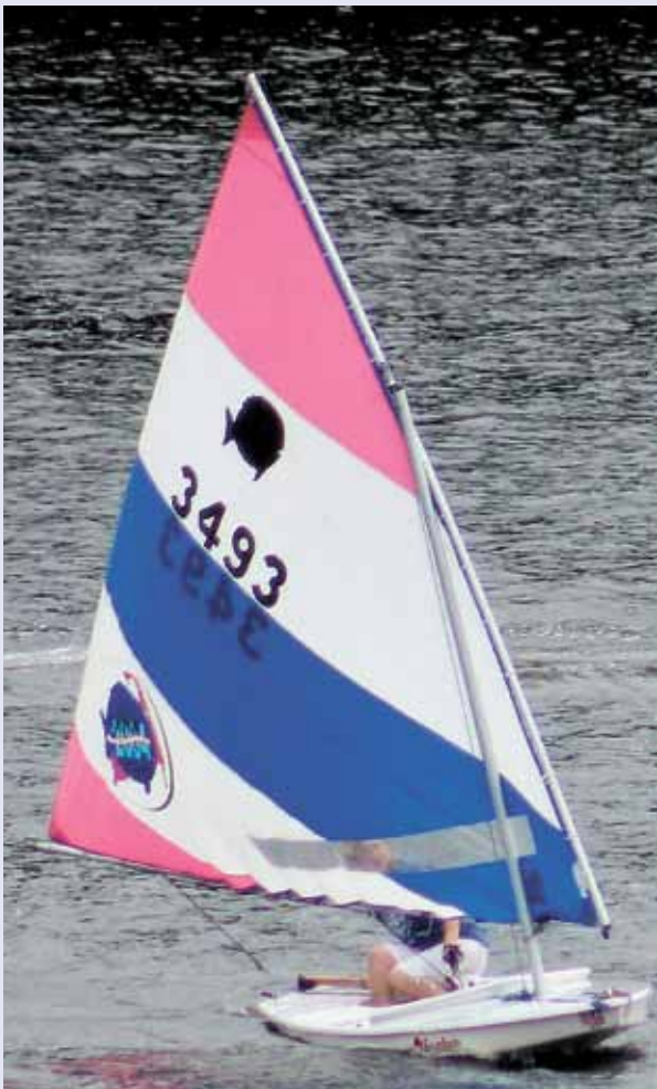
Pictured is Nancy Grimaldi, "Window View"