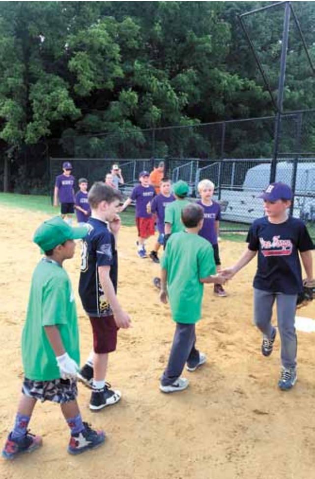
Hornets and Wasps players congratulate each other on another great game