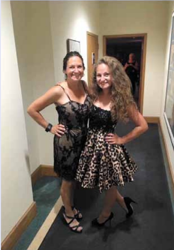
The Annunziatta gals dressed for success

Over 100 women enjoyed fabulous fashions, food and friends at the Women's Auxiliary Annual Fashion Show. Donna's Boutique dressed our members to perfection. Despite the heat from an air conditioning malfunction, everyone stayed for an enjoyable evening. Thank you all for coming out and supporting the Highland Lakes Auxiliary. Join us in the Lake Room Tuesday mornings at 10 am. Continental breakfast and babysitting provided.