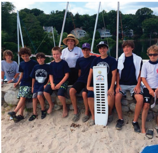
Eight Junior Sunfish sailors competed off lake and we came home with one of the trophies.

Summer is almost over but we must get out and play!!! Anyone, 18 and over, interested in playing volleyball on Sundays, please come down to the multi-purpose court at Beach 1. We will begin playing at 6:00, and will end when we no longer can see the ball. The interest continues to grow so much that we had to move the day to give people a rest! All skill levels are represented, and all who come play. As with all HLCC activities, please wear your badge. See you on the court!