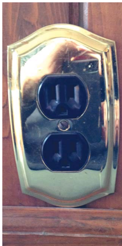
Openings around outlets often let cold air in, but drafts can be prevented by inserting a pre-formed outlet insulating cover which goes unseen once outlet plate cover is put in place.