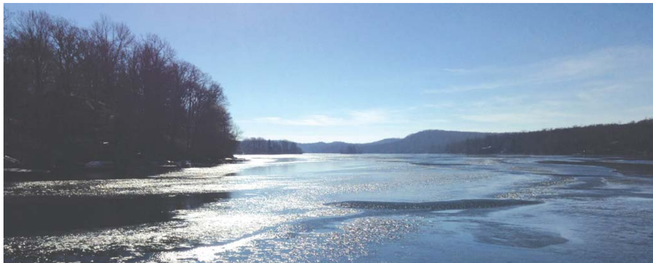
A blustery view of the lake