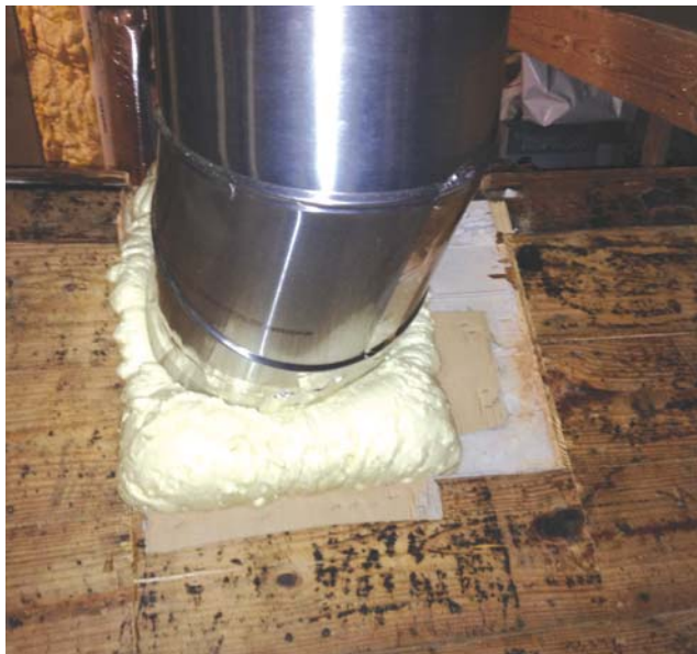
Sprayed foam insulation closes gaps that would allow cold air in if left unattended.