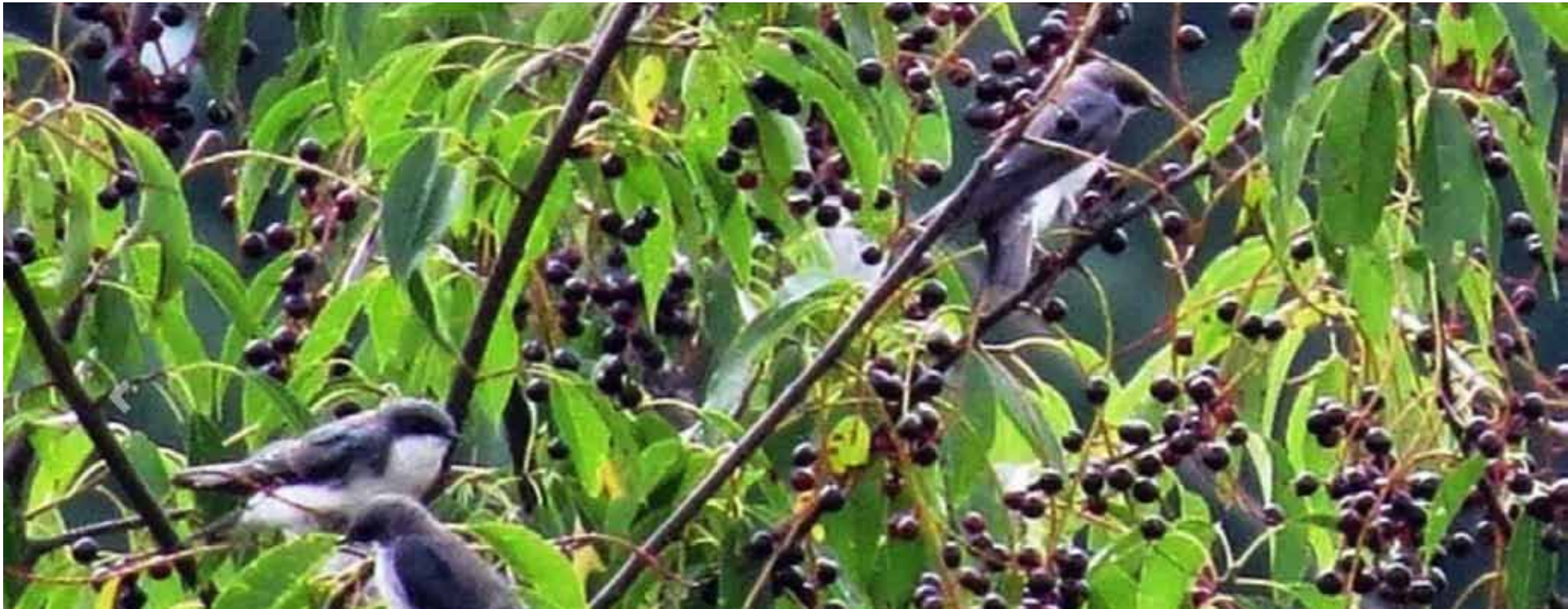
Black Cherry Tree with Fruit