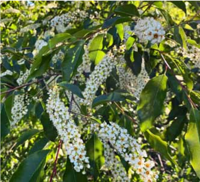
Black Cherry Tree with Flowers

There are many benefits to adding a native tree to your yard. If you find yourself in a situation where you would like to add a tree or if you must remove one, consider planting