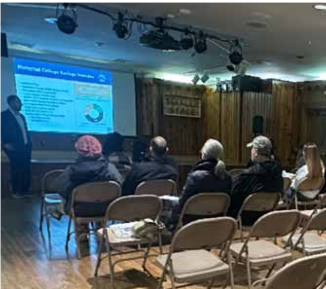
Audience of the College Funding night held in January.

Art is not usually something that happens in a few minutes. Creating it can take days, weeks, or even months, no matter the medium. Painting, ceramics, sewing, and other mediums can take a long time to produce. Even a photograph may take time and effort to print, mat, and frame in your artistic style. So, although the Art Show won't take place until the summer, it's never too early to get creative! In addition to the annual categories and themes (including the best rendition of a tree), our special theme in 2024 is Fish of Highland Lakes. We look forward to seeing your art!