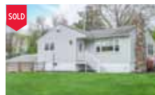
188 Highland Lakes