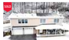
165 Breakneck Road