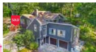
322 W. Lakeshore Dr