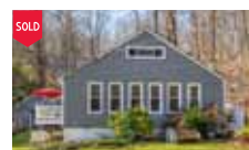
530 Old Homestead