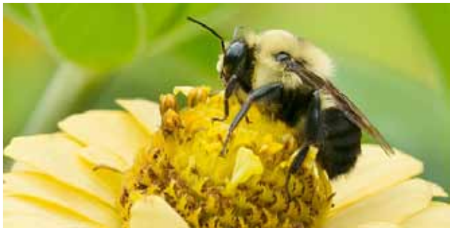
Common Eastern Bumblebee

As the warmth of late spring envelops our lakes, the air is filled with the gentle hum of an often overlooked but vital part of our ecosystem: native bees. These industrious creatures play a crucial role in pollination, supporting the growth of flowers, fruits, and vegetables. In our community alone, a variety of native bee species contribute to the health and vibrancy of our local environment.