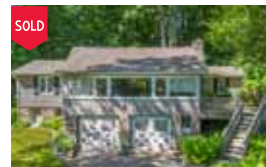
211 Wiscasset Rd