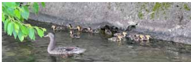
Highland Lakes - a great place for young and growing families.