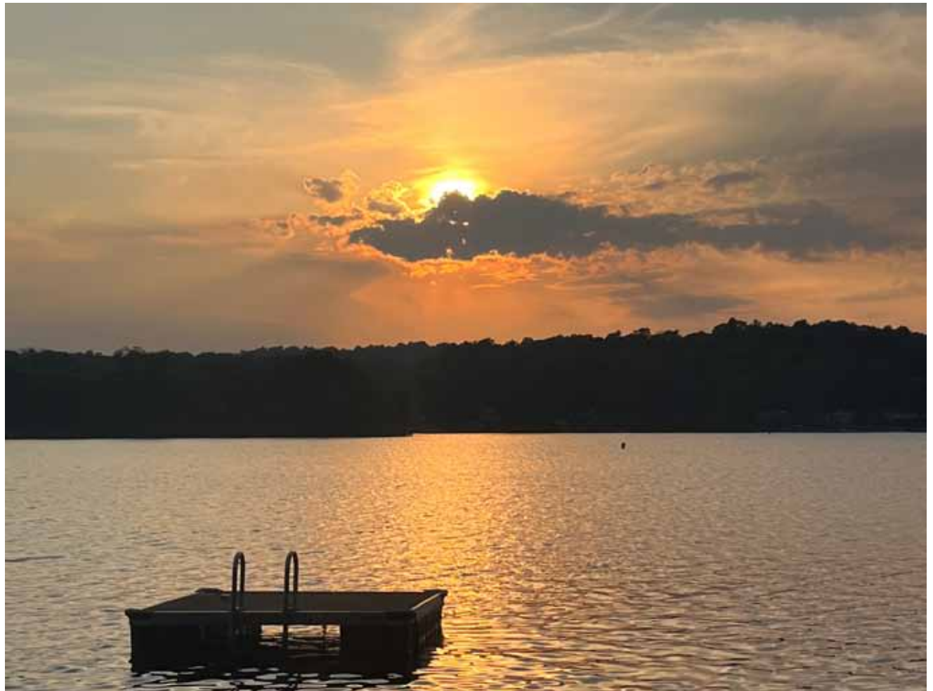
Sunset on June 22 from Fahmy residence