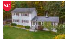
504 Old Homestead