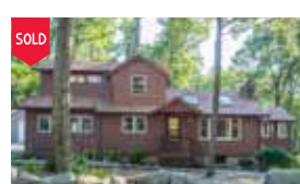
9 Anawa Rd