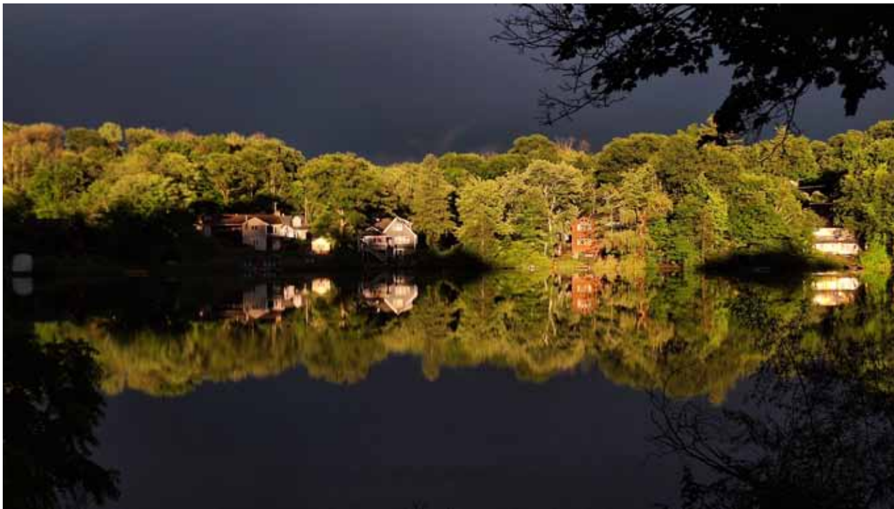
Friday, June 14 presented some ominous skies after a storm.