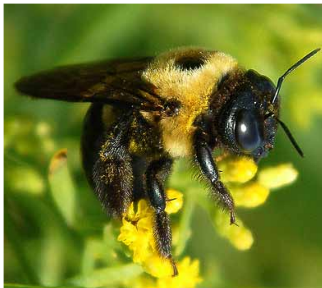
Eastern Carpenter Bee

To get involved, follow this link: https://xerces.org/