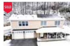
165 Breakneck Road