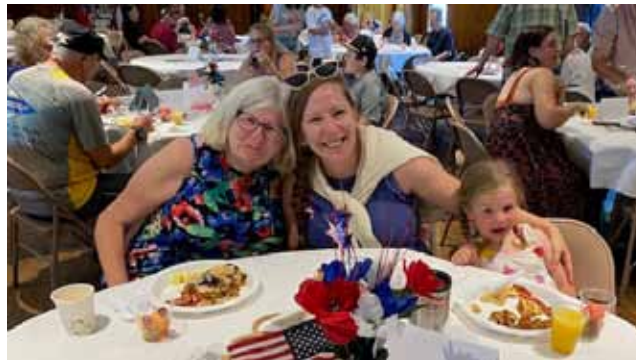
Independence Day Breakfast