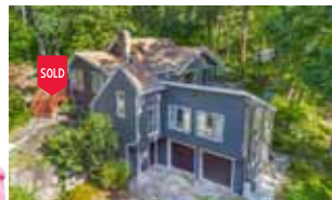
322 W. Lakeshore Dr