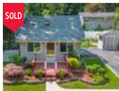
205 Winetka Dr.