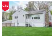
188 Highland Lakes