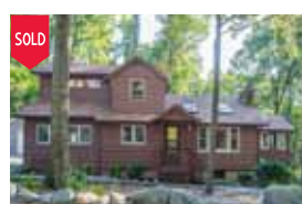
9 Anawa Rd