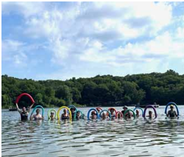
Amazing way to start the day, another wonderful aqua aerobics class July 8!