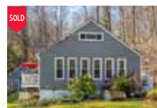
530 Old Homestead