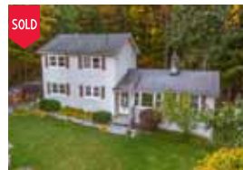
504 Old Homestead