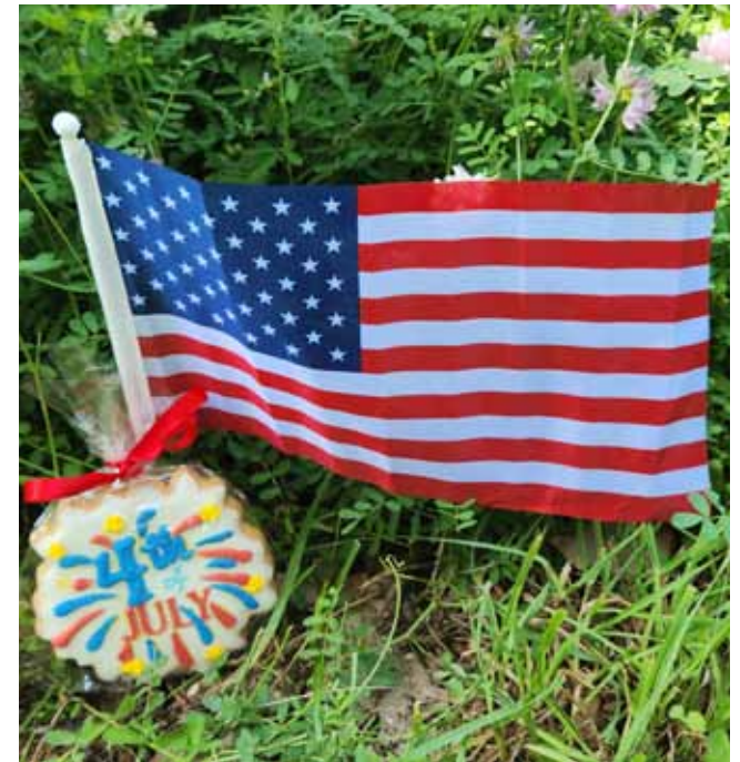
Sofia 6 and Seneca 8 years old

Photo Challenge # 2: Make a splash! This week we're going to focus on the movement of the water! Grab your siblings or your friends for help with this one. Capture an image of someone making a splash in one of the lakes; like a cannonball off the dock, kids playing in the shallows, or someone gliding on a paddleboard. Remember to stay safe and be creative.