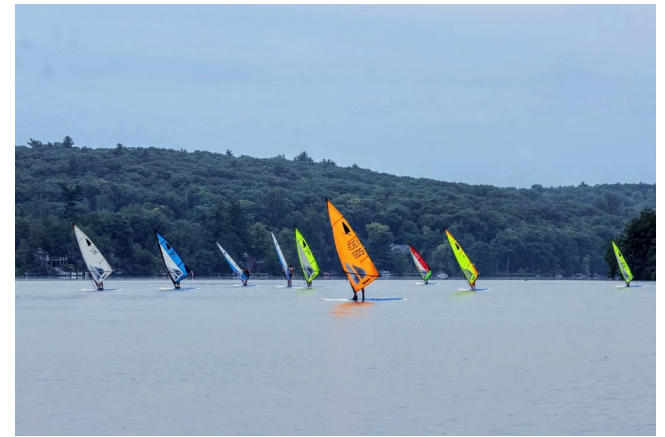
The 3rd annual Spring into Summer Windsurfing Regatta.

Join us for some fun race action this summer, every Saturday at 3 pm. The season lights up with a bang on the 4th of July and our country's 250th birthday. See you on the line.