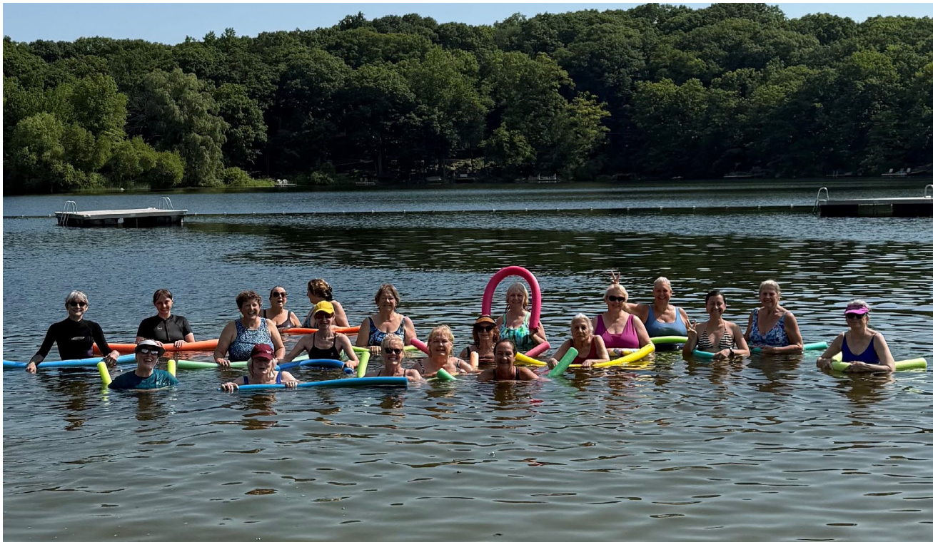
Water Aerobics draws a good turnout for the first class of the summer.