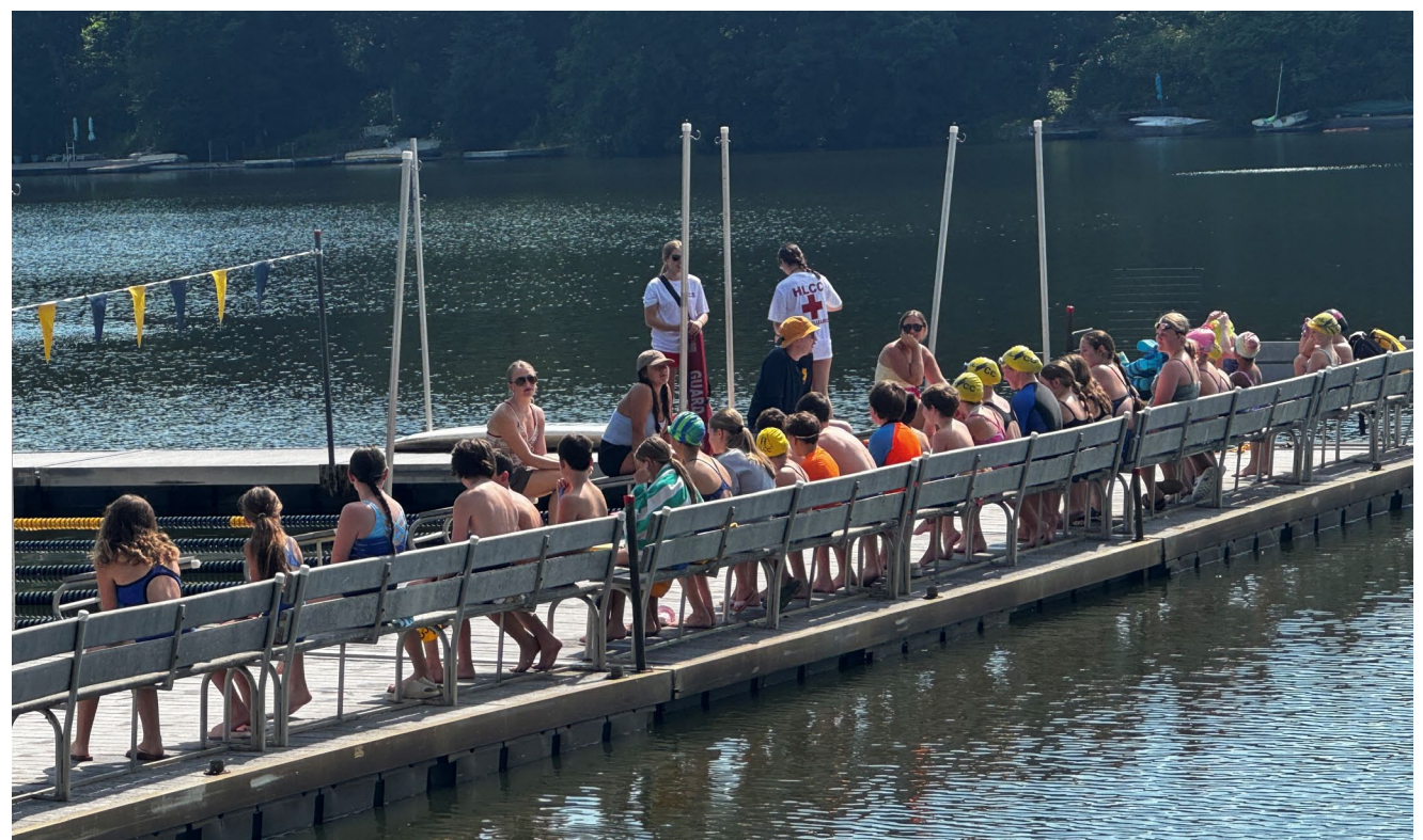
First HL Swim Team practice.